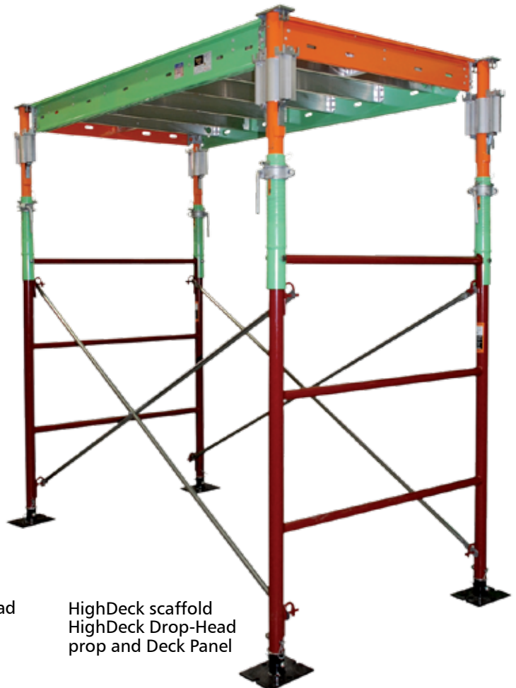
HighDeck scaffold HighDeck Drop-Head prop and Deck Panel