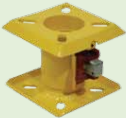
TABLA HighDeck Quick Release base