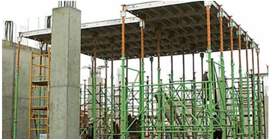
TABLA HighDeck scaffold