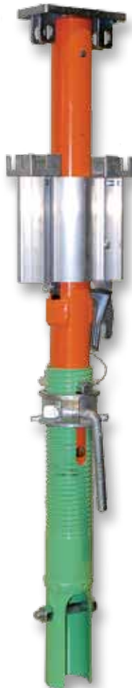
HighDeck Drop-Head Prop for scaffold

same drop-head as standard HighDeck makes erection and dismantle quick, easy and safe